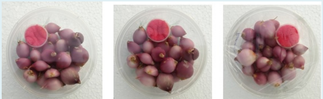
Fig. 2 Development of scavenger for Active packaging of Small Onion