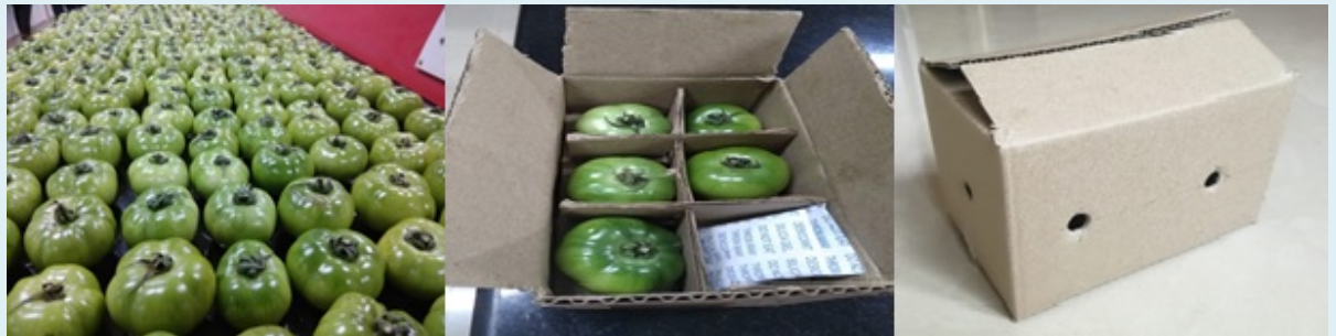
Fig. 1. Development of Active packaging system for Tomato